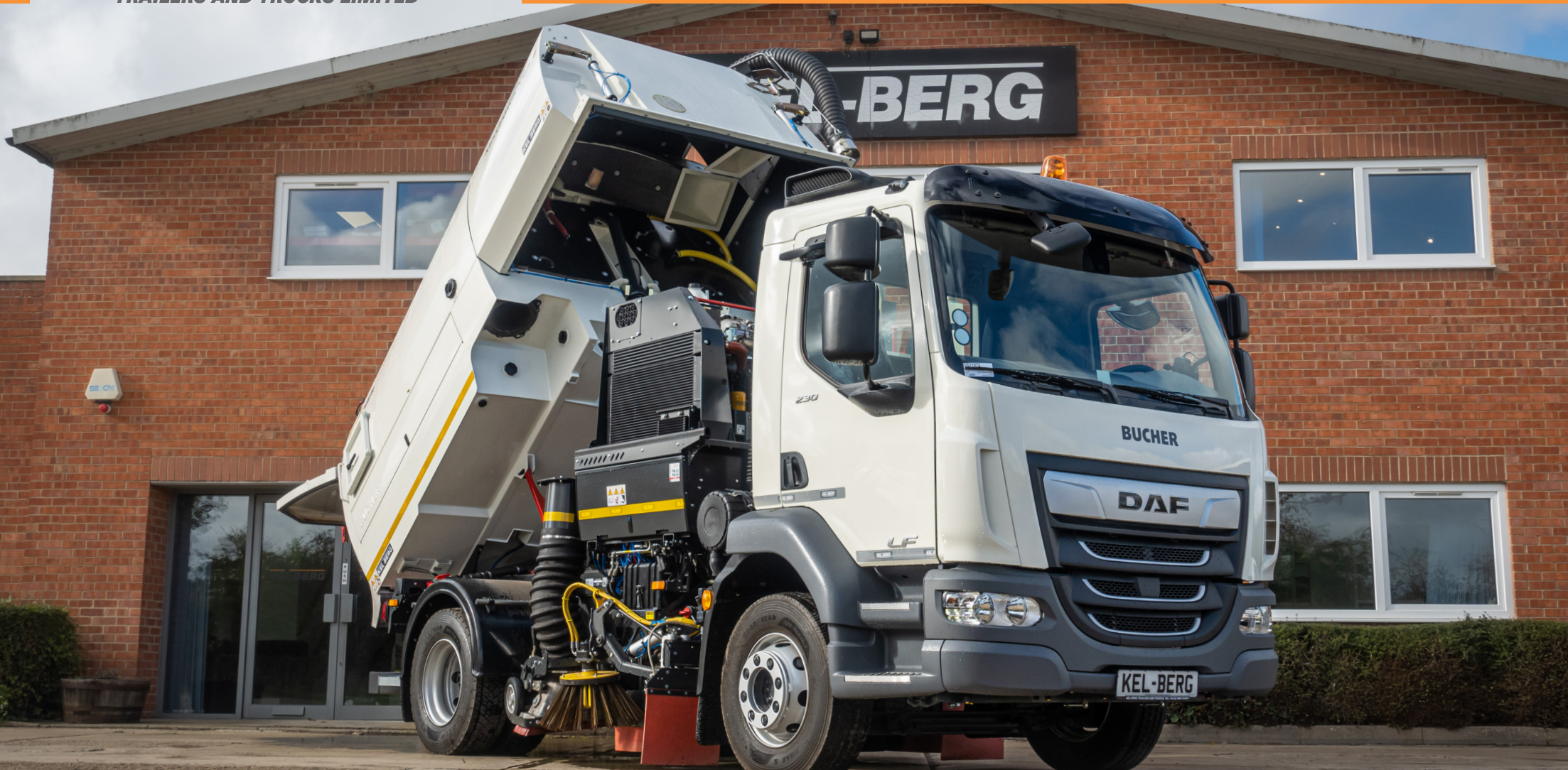
BUCHER ROAD SWEEPER