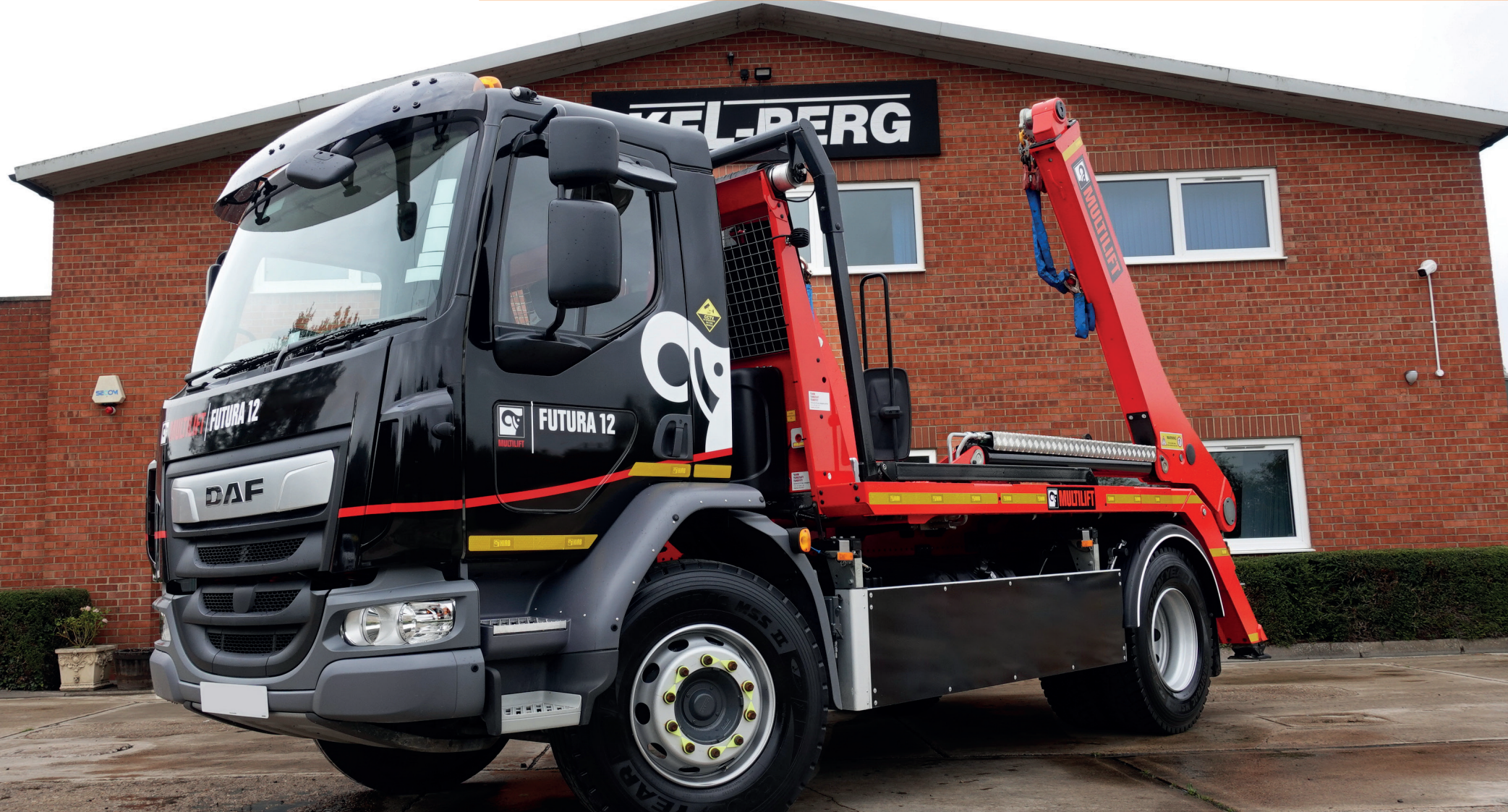
DAF LF230 4x2 Multilift Futura 12 Skip Loader